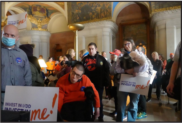
Just a few pictures of the groups attending the rally in Albany earlier this month drawing attention to the "Traveling with Dignity" movement.